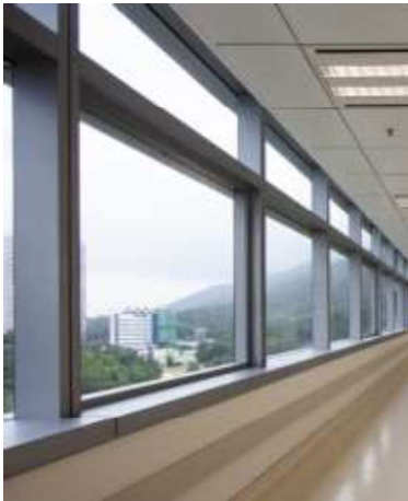
Figure 7.2: Fixed windows in corridor

Awning windows are also known as 'hopper' windows. These refer to windows hinged from the top. Awning windows should not be used in multi-storey buildings because they can act as smoke/ heat scoops from fires in storeys below.