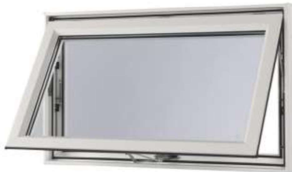
Figure 7.3: Awning window